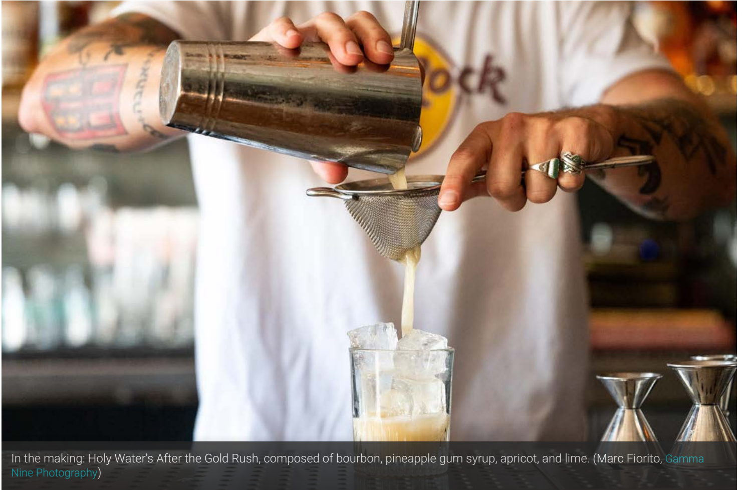
In the making: Holy Water's After the Gold Rush, composed of bourbon, pineapple gum syrup, apricot, and lime.