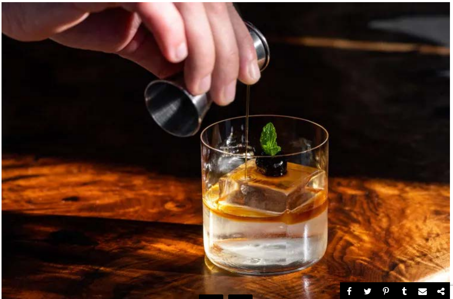
True Laurel's Mai O Mai.

20. House Campari Soda at Buddy. Open your palate, open your mind with bitter vermouth, cherry quinine liqueur, aperitivo wine, orange bitters, and soda. // 3115 22nd St. (Mission) , buddythebar.com