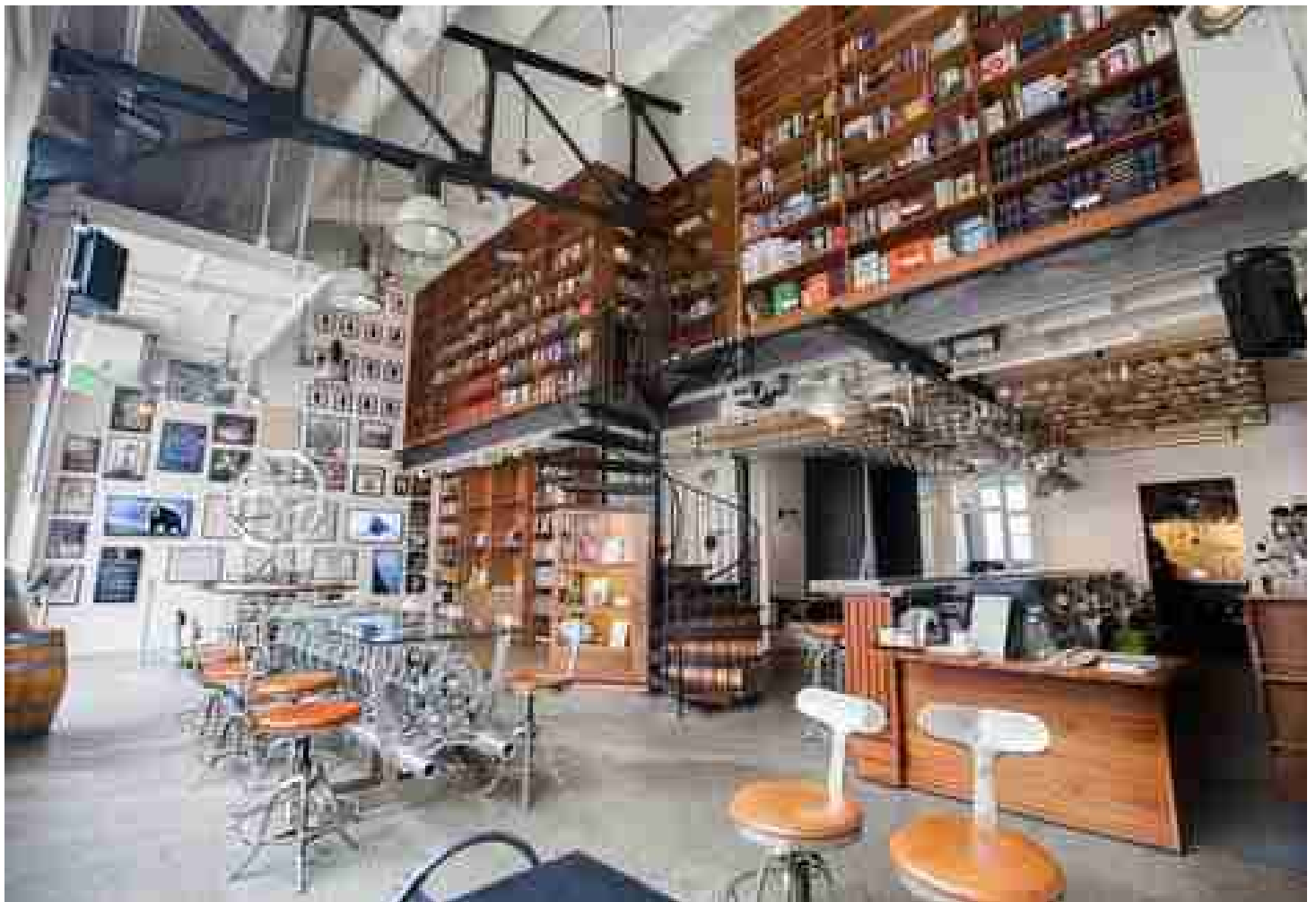
THE INTERVAL AT LONG NO