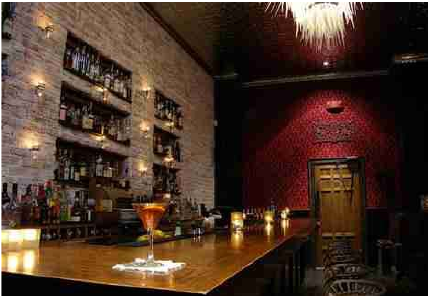
BOURBON AND BRANCH

The most polarizing of all neighborhoods. Just mentioning that you're going to spend time in the Marina can create a series of eye rolls and knee-jerk reactions, almost to the point of parody. To be fair, that is also because the 'hood itself can seem like said parody of tank-wearing bros and the ladies in Lulu who love them, a weird outpost of LA combined with a small New England liberal art's school's fraternity scene mixed with a perpetual outdoor exercise class. But once you get past all of those Basic warnings, there is some fun to be had. The Interval is hands down one of the best cocktail bars in the country, and is an unvarnished gem sitting right there in Fort Mason for anyone to experience. Reed & Greenough, The Tippy Pig, and Belga all make a good cocktail as well, and there's a somewhat underrated dive bar scene, with classics like Final Final, my personal favorite CC's, and Horseshoe Tavern. But if you're looking for the true Marina drinking experience, you have no choice but to hit Monaghan's around brunch time during football season. You've been warned.