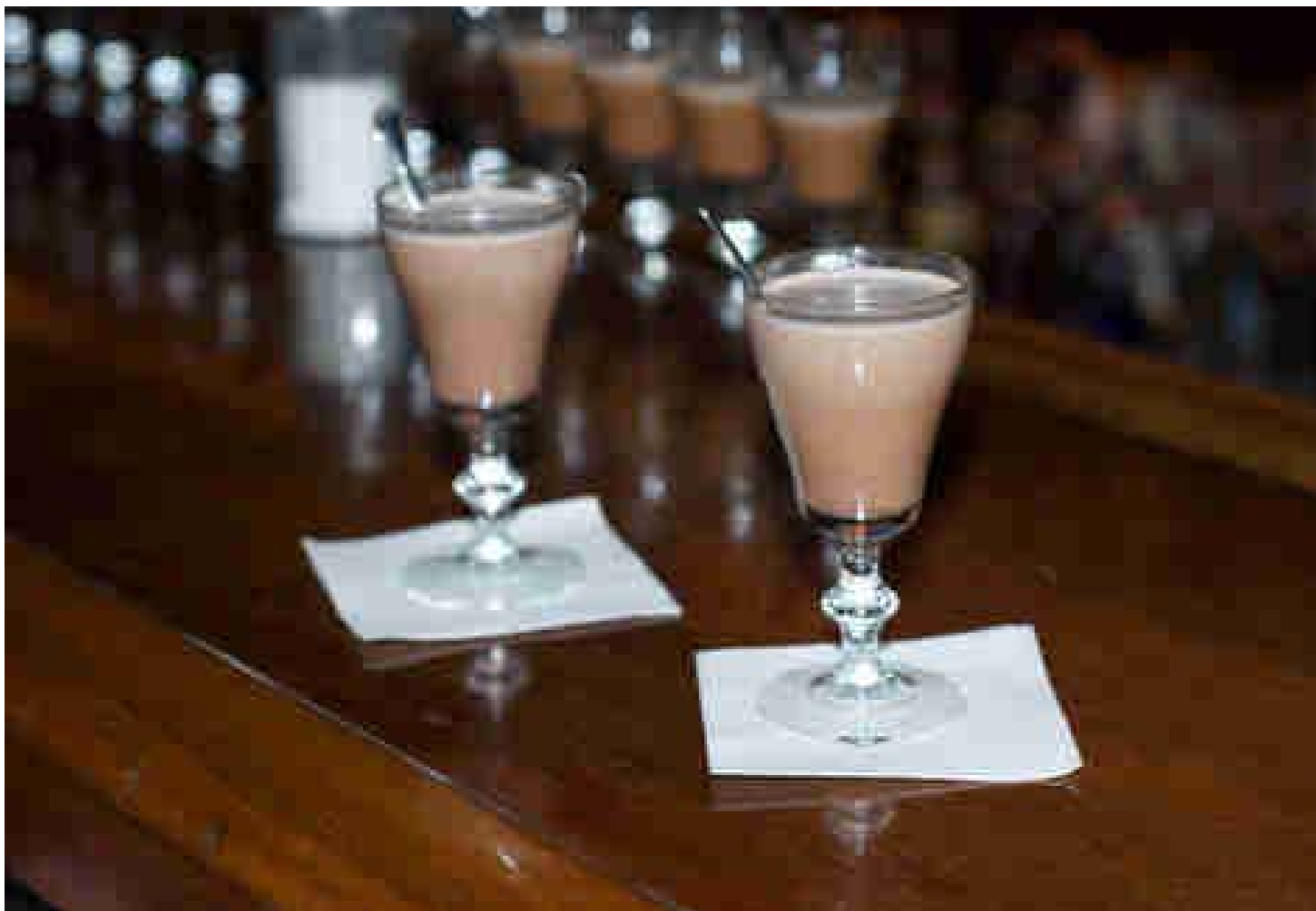
TOSCA CAFE'S CAPPUCCINO

tat-cho legend Bullitt for, um, tat-chos, Union Larder and Bacchus for wine. Just tell the kids to keep it down.