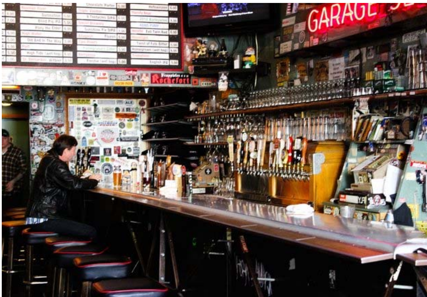
TORONADO