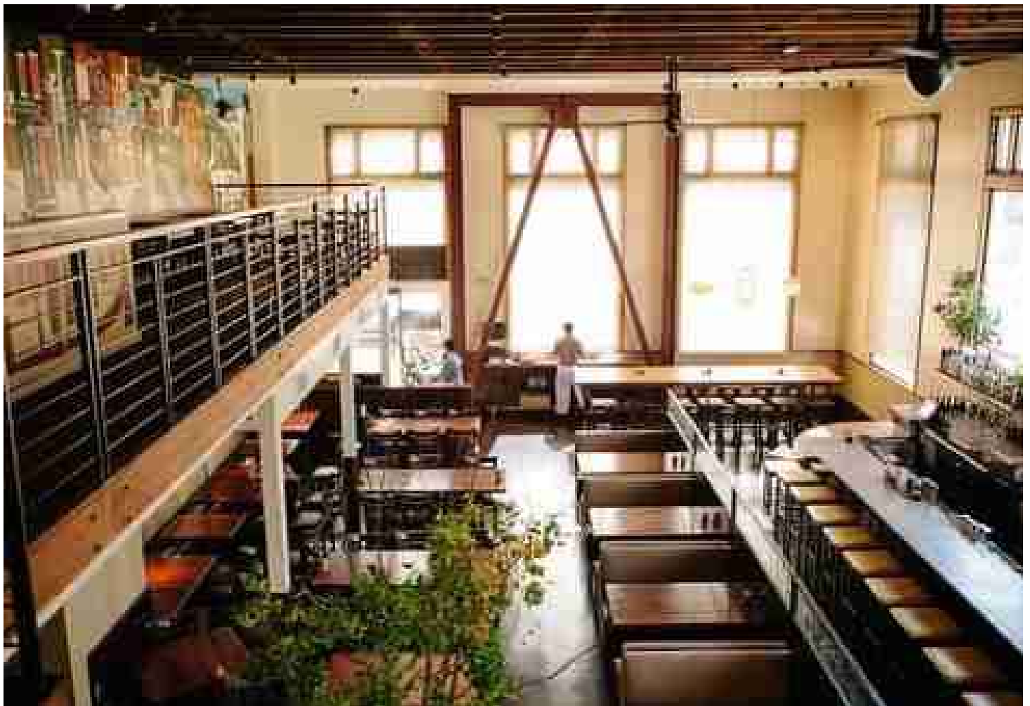
NOPA | NOPA