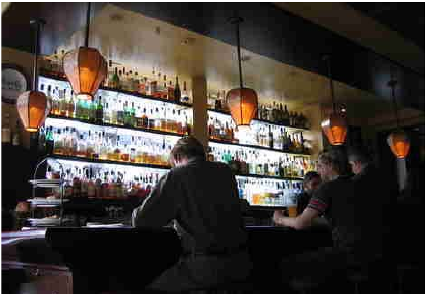
ABSINTHE

Any glance at a map will tell you that North Beach takes up a huge swath of territory in betwixt Russian Hill, Fisherman's Wharf, Jackson Square, and the Embarcadero. And any glance at the normal mix of tourists and other JV revelers who pack in on the weekends will tell you the reason why this classic 'hood won't get higher than three. That said, SF's bronze drinking 'hood has a treasure trove of great bars if you know where to look, from one of the old-school standbys in the city's cocktail scene (15 Romolo), to three beer-soaked gems (La Trappe, Church Key, and Rogue), to two very good restaurant/bar scenes at Original Joe's and Park Tavern. Savoy Tivoli is a neighborhood legend for weekend jazz since before the Great War, and I haven't even named likely half a dozen other bars with live music, decent beers, and somewhat of a scene. Though unless you actively seek out mayhem, it's usually better to hit North Beach during the week.