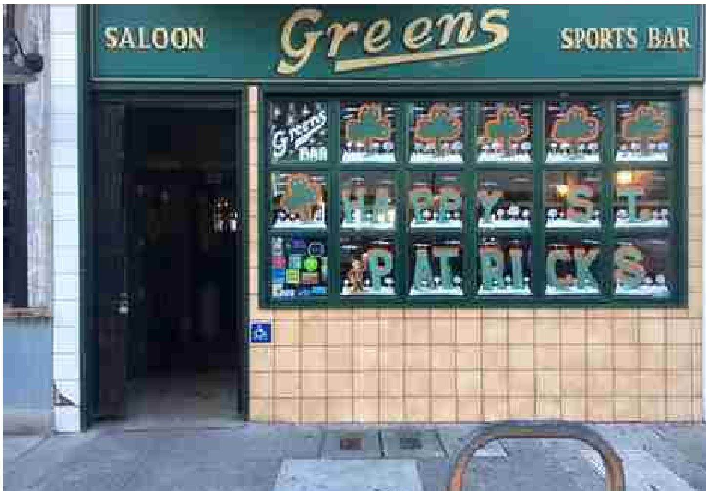
GREENS SPORTS BAR

The sort of made up NOPA area is a grand place to drink. You can spend your day on Divisadero between Golden Gate and Fell from morning to 2am, and you'll be able to hit a dozen decent spots, and a half dozen great ones. The legend OG Nopa itself anchors the hood, and gives you the best cocktails, but you can drink mezcal and play dominoes in La Urbana's El Garaje bar, eat oysters and sip drinks at Bar Crudo, sip beers outside at Bean Bag, or go down to Madrone for late night and be sketchy. After all, you've been on this damn street for the entire day.