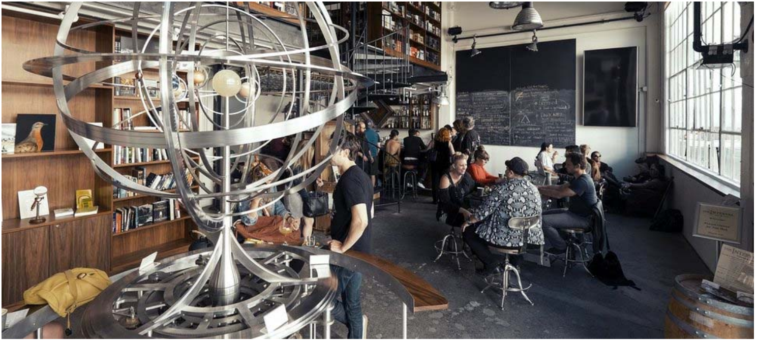
THE INTERVAL