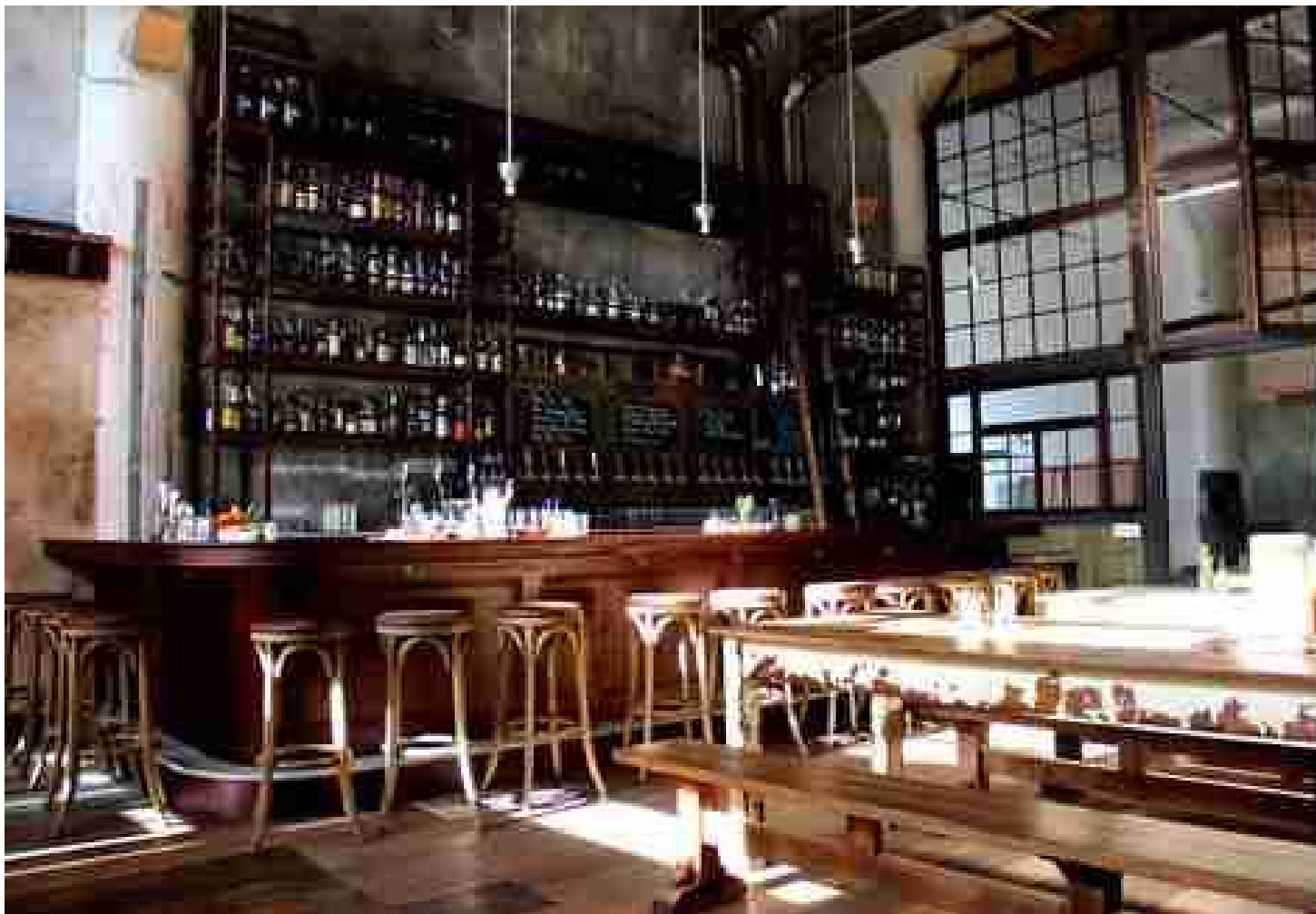
SMOKESTACK | JOE STARKEY/THRILLIST