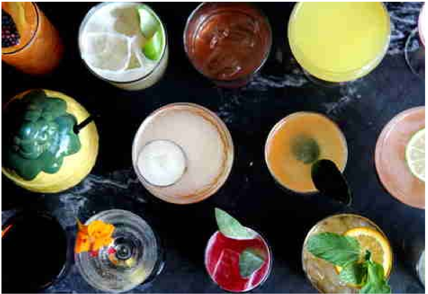
COCKTAILS AT TRICK DOG