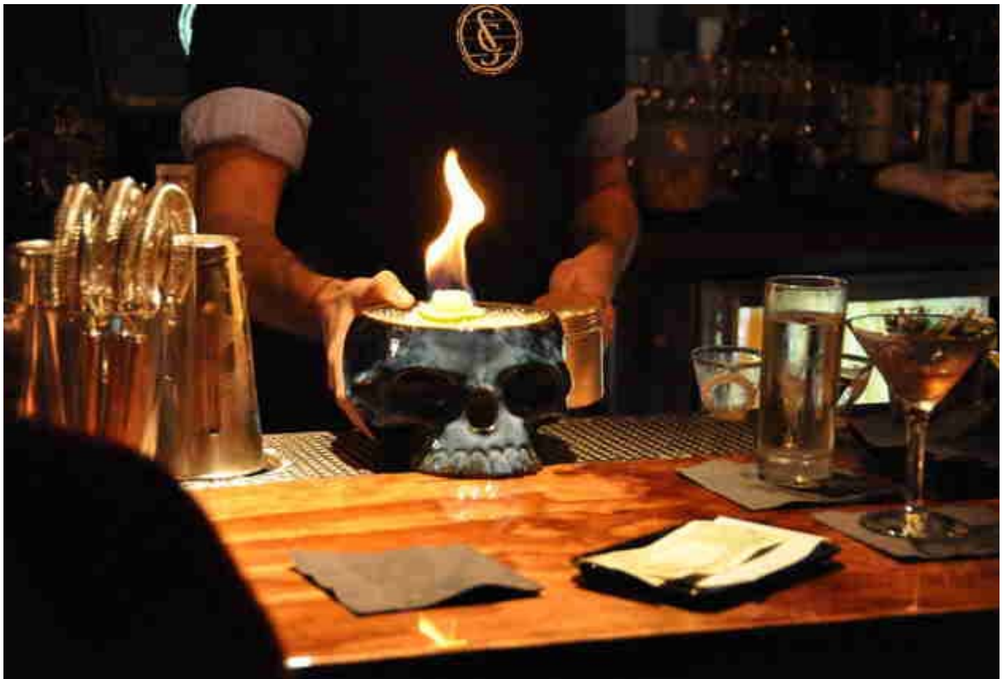
SMUGGLER'S COVER